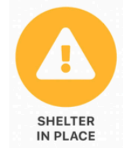
SHELTER IN PLACE